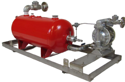
J-7000 w/1" Diaphragm Pump Skid