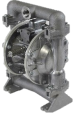
DP-1 - 1" Diaphragm Pump