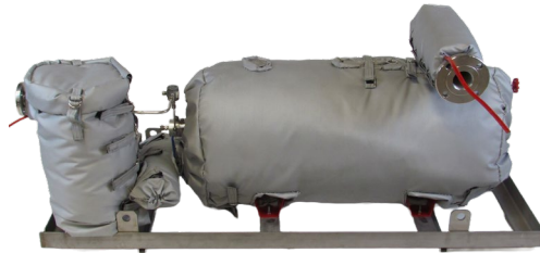
J-7000 SM-P DP-1 CW Adder