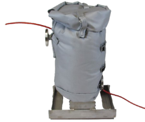
DP-1 - CW Adder